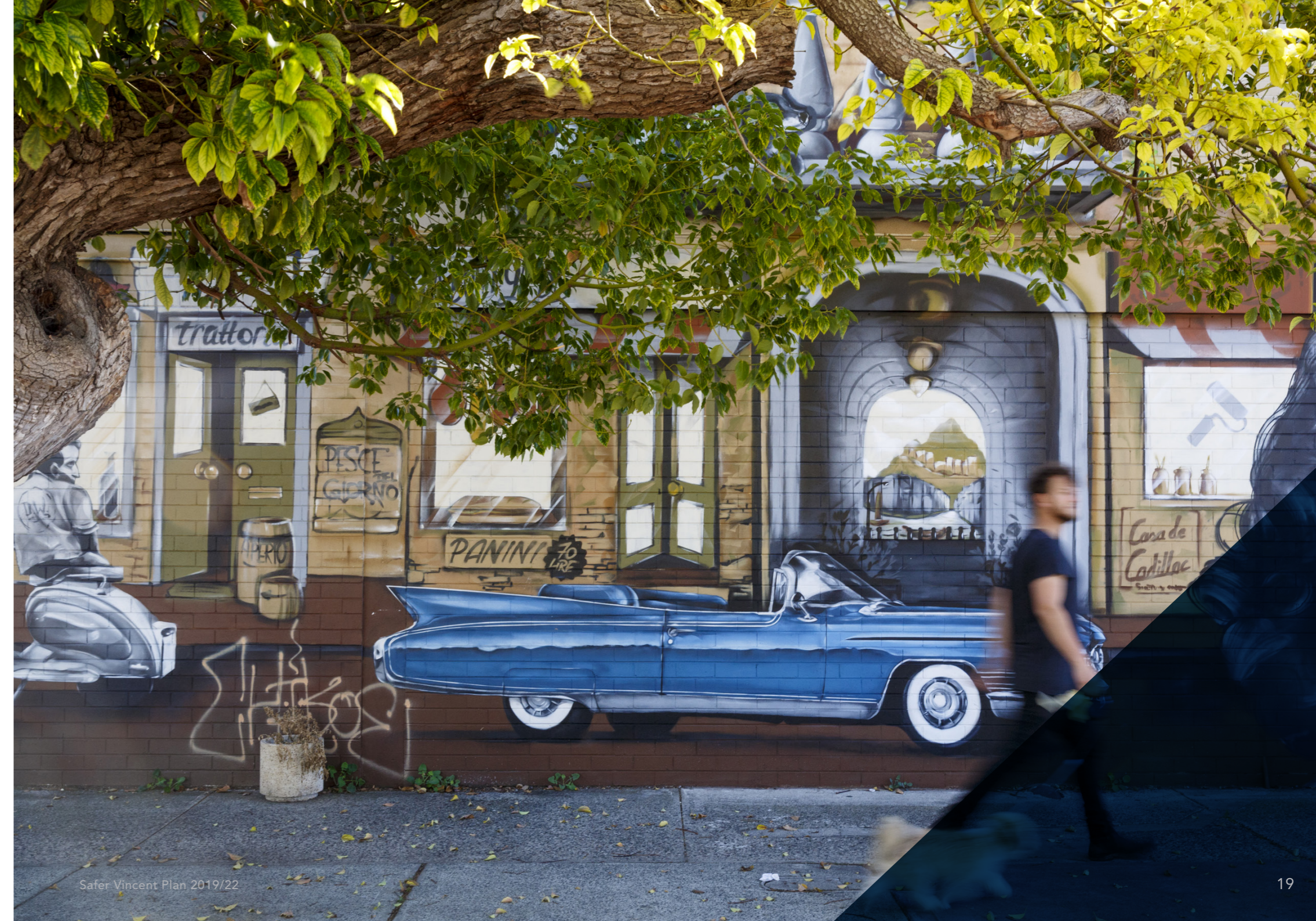
Safer Vincent Plan 2019/22